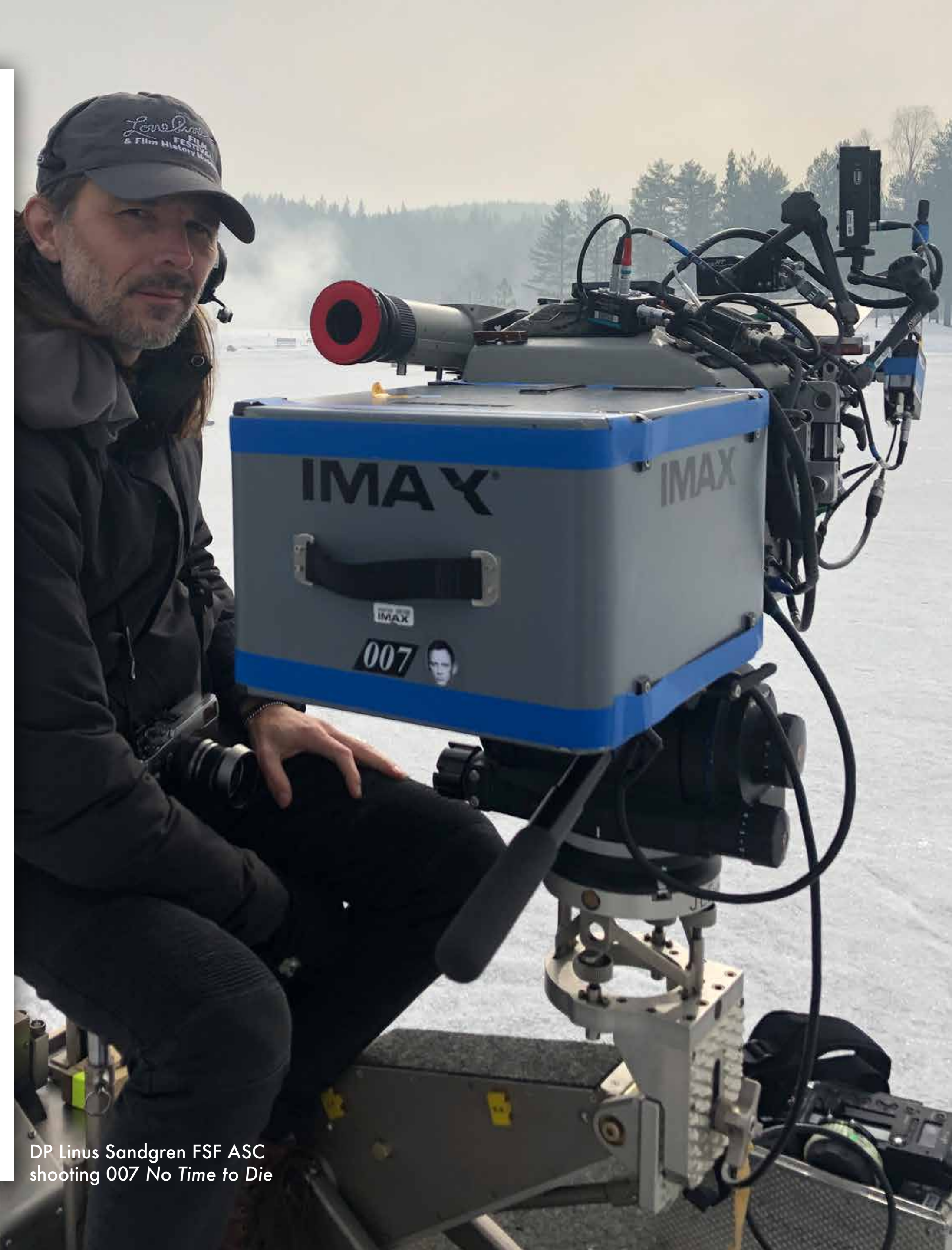
DP Linus Sandgren FSF ASC shooting 007 No Time to Die